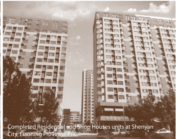
Completed Residential and Shop Houses units at Shenyang City, Liaoning Province, PRC