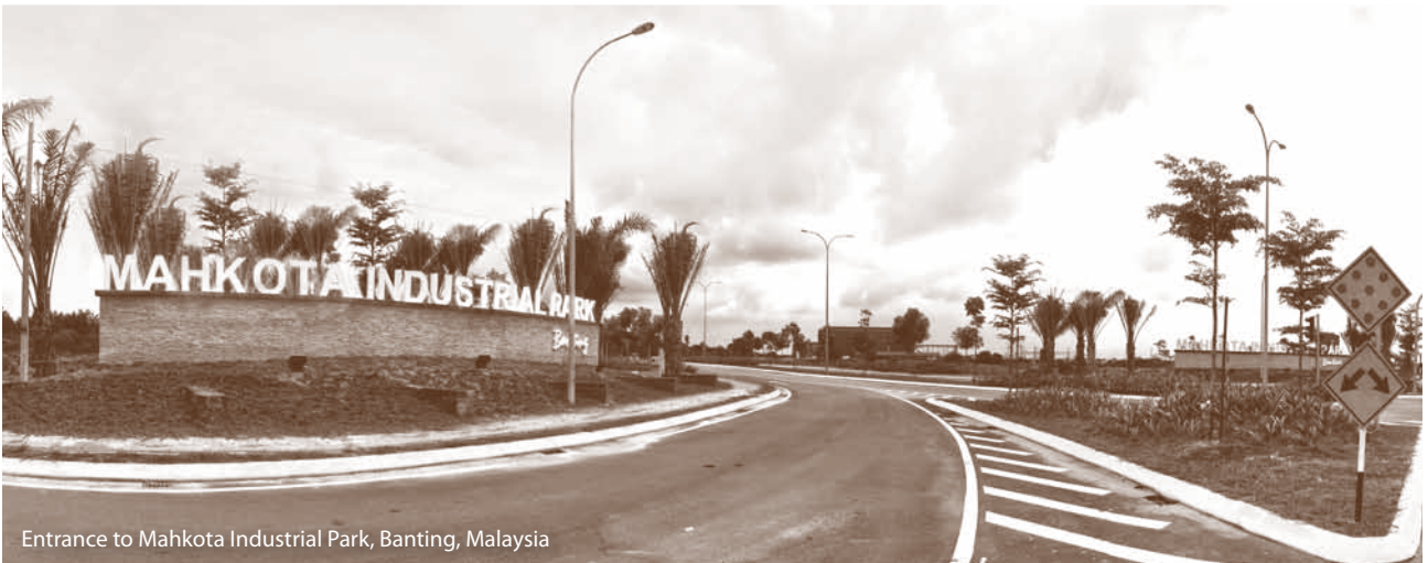
Entrance to Mahkota Industrial Park, Banting, Malaysia