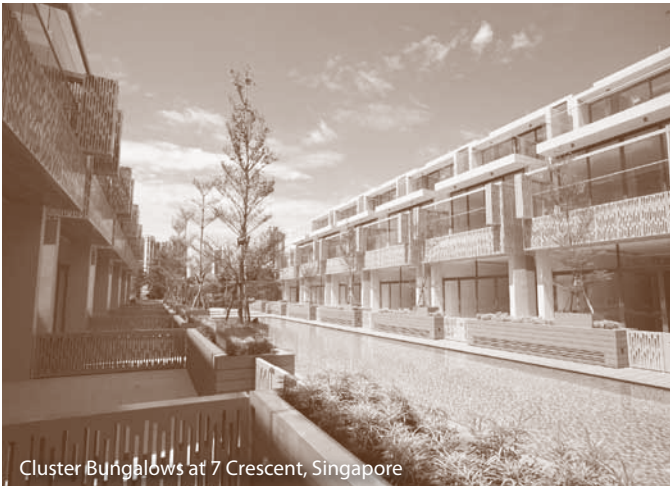
Cluster Bungalows at 7 Crescent, Singapore