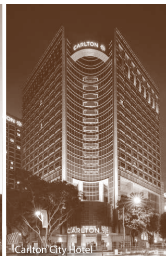
Carlton City Hotel