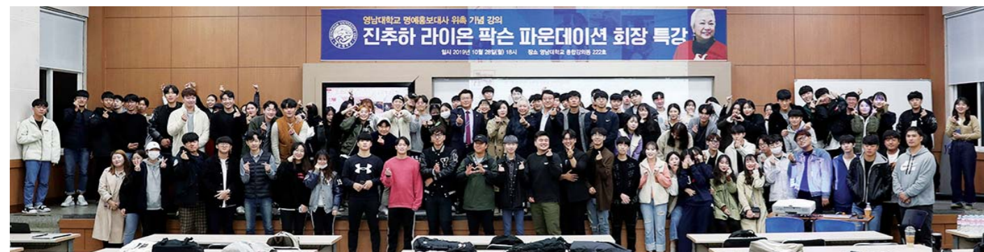
► Group photo with students and lecturers of Yeungnam University. ► Gambar berkumpul dengan pelajar dan pensyarah Universiti Yeungnam.