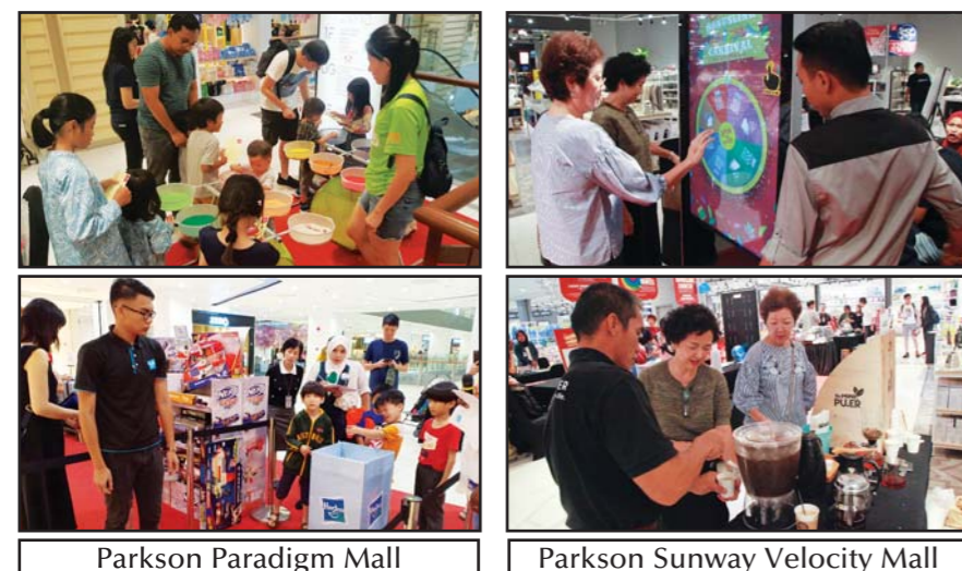
Parkson Paradigm Mall