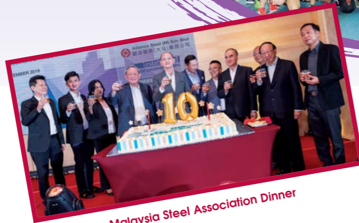
Malaysia Steel Association Dinner