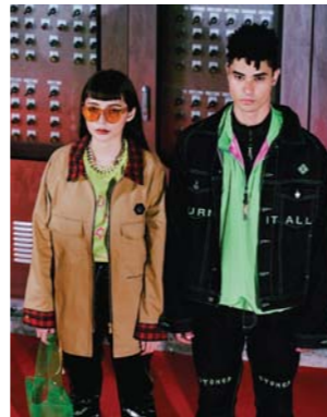
STONED & CO